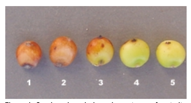
Figure 1. Sorghum kernels in various stages of maturity harvested from the same panicle from the most mature (1) to the least mature (5). The black layer is first visible in the second stage and becomes more distinguishable as the seed loses moisture.

With practice, you will be able to disregard the differences in grain color and easily distinguish the black layer to determine the relative maturity of the crop.