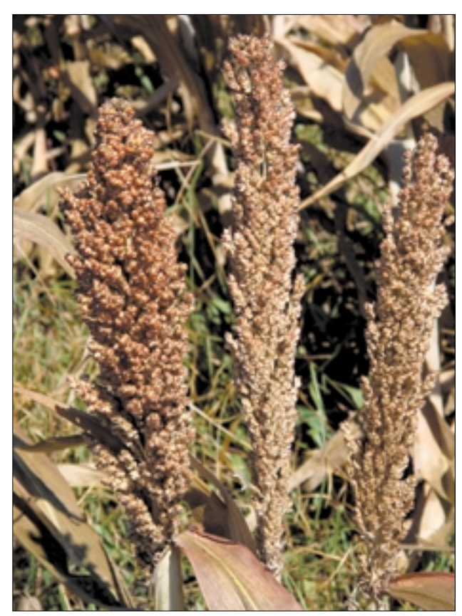
Figure 2. Three increasing levels of charcoal rot (left to right). Infected plants die prematurely before all the grain can be filled. Sorghum heads appear dull and lackluster, and the spikelets may droop, giving the panicle a ragged appearance. Such panicles contain some shriveled grain, with the worst being found at the base of sorghum head, which would have been the last grain to mature.

As with all farm chemicals, read and follow label directions carefully before applying the product.